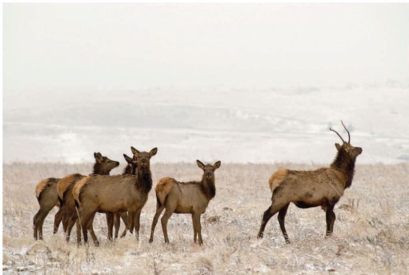
An elk bull with harem at the mouth of Coal Creek Canyon.