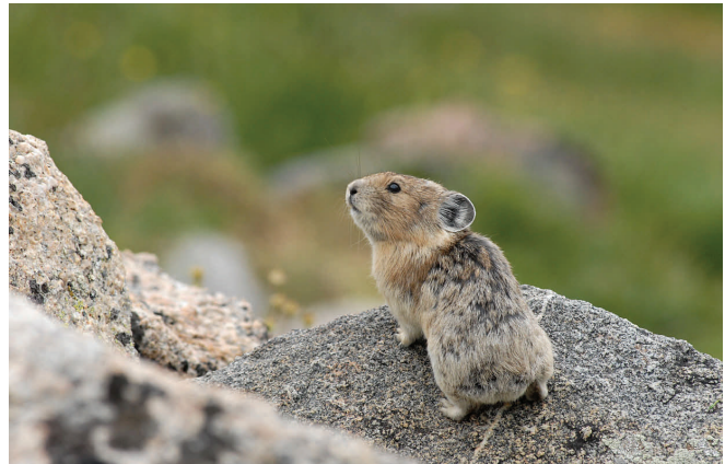
Pika, Pikas will be featured at the Annual Meeting