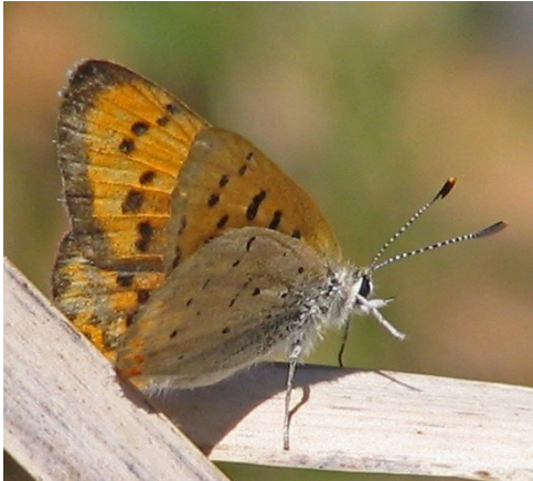
Purplish Copper, male, Rock Creek